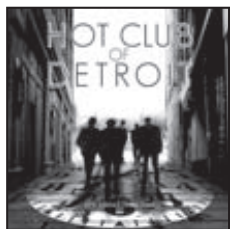
It's About That Time Hot Club of Detroit (Mack Avenue)