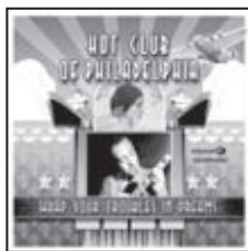
Wrap Your Troubles in... Hot Club of Philadelphia (Jazz Manouch)